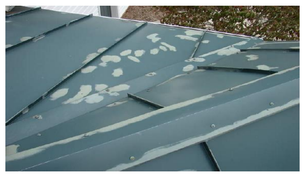
Figure 1 - Appearance of a pre-coated metal roofing where a low performance field applied air-dry paint system was used

When applying a field applied air dry paint system it is important to apply a system with the same quality and performance of the original factory paint system to prevent areas from different weathering rates. Figure 1 shows an example of what can happen after several years of UV exposure to a building roof when a low performance field applied air-dry paint system is used over a high performance factory paint system.