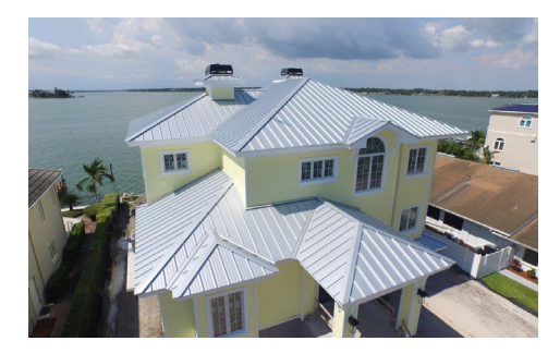
In hurricane prone areas, your roof system should be rated for its ability to withstand high winds and uplift.