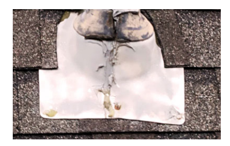
Damaged or aged roof jacks may allow water leaks in your roof.

If your roof is showing any of these signs, it may be time to start planning for a new roof. This Buyer's Guide will walk you through various aspects of the re-roofing process... from things to consider when selecting a new roof to material comparisons and options to questions you should ask your roofing professional. It is our goal to assist you in your re-roofing journey and to help make your experience as seam-less as possible.