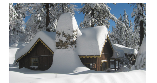
Heavy snow and ice damming can weigh down your roof potentially causing water leaks or worse.