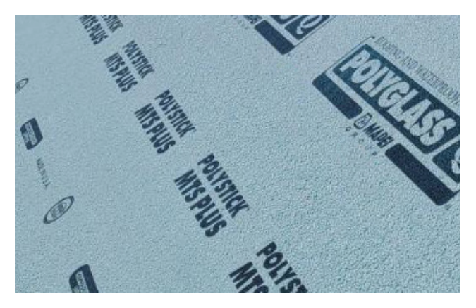
Modified bitumen self-adhered underlayment - Polyglass.