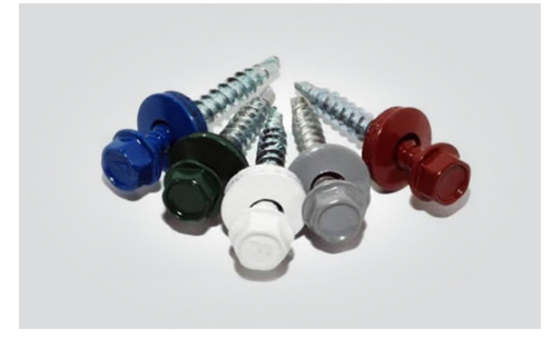
Selection and use of the correct fasteners can have a big impact on the roof's performance and longevity.

Sealants are designed to meet specific requirements. Thermal movement, expansion and contraction, and weathering requirements are the most common reasons for the use of substrate compatible sealants. There are specific instances where non-compatibility of substrates can lead to corrosion. Always determine if the sealant chosen will perform as required through reference to literature and field testing. Most metal roof manufacturers provide a list of approved sealants, and <u>it is imperative to follow</u> <u>these recommendations</u>. If a different sealant than what is recommended is planned for use, it is best to get approval from the metal roof manufacturer to avoid a compromise of the product warranty. Sealants are a small cost in relation to the overall roofing cost, however proper selection and application is critical to ensuring a long service life on any metal roof.