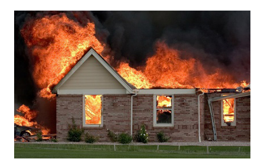
Your roof can be the first line of defense when living in fire prone regions.