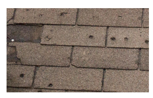
Large and fast-moving hail may compromise your roof structure's integrity.

Insurance – which roofing materials are rated to meet/exceed insurance company policy requirements? Be sure to clarify with your insurance company what types of hail damage would be covered and what would not, as well as specific installation requirements they may have for the roofing materials