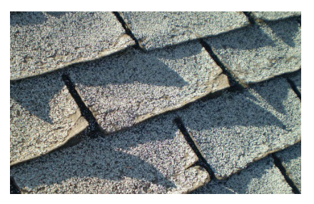
Asphalt roofing will become dry, brittle and misshapen when aged.