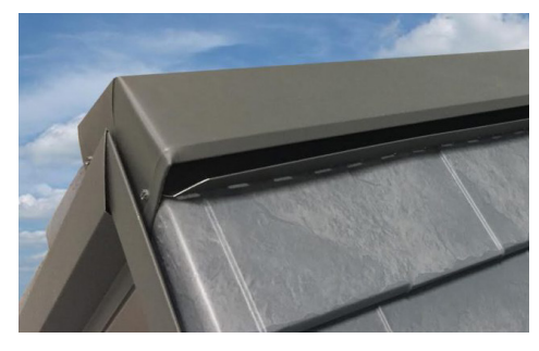
Ventilation helps balance air flow in your home, reducing the risk of mold and condensation.