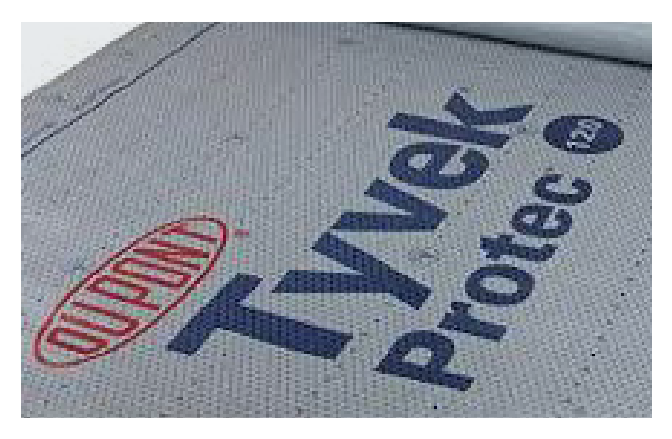
Underlayment is a critical step in the roofing process.

• Due to the thin nature of the membrane, they generally do not have a high degree of puncture resistance, however, many synthetics have excellent tear strength and UV resistance which helps increase the exposure time and resist other factors on the rooftop.