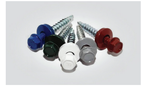
Selection and use of the correct fasteners can have a big impact on the roof's performance and longevity.

Roof curbs are used to support roof penetrations such as skylights. Roof jacks are used to flash around pipes and other similar roof penetrations. Both curbs and roof jacks reduce the possibility of water leaks and provide additional protection against roof leaks.