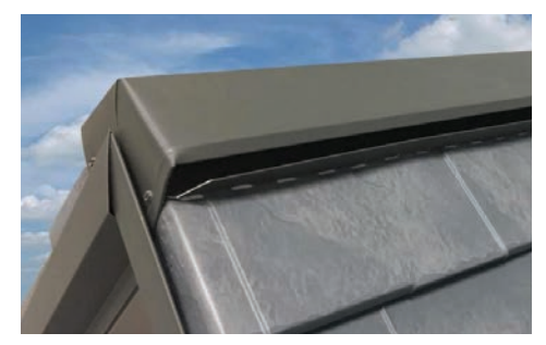
Ventilation helps balance air flow in your home, reducing the risk of mold and condensation.

Sealants are designed to meet specific requirements. Thermal movement, expansion and contraction, and weathering requirements are the most common reasons for the use of substrate compatible sealants. There are specific instances where non-compatibility of substrates can lead to corrosion and leaks. Always determine if the sealant chosen will perform as required through reference to literature and field testing. Most metal roof manufacturers provide a list of approved sealants, and it is imperative to follow these recommendations. If a different sealant than what is recommended is planned for use, it is best to get approval from the metal roof manufacturer to avoid a compromise of the product warranty. Sealants are a small cost in relation to the overall roofing cost, however proper selection and application is critical to ensuring a long service life on any metal roof.