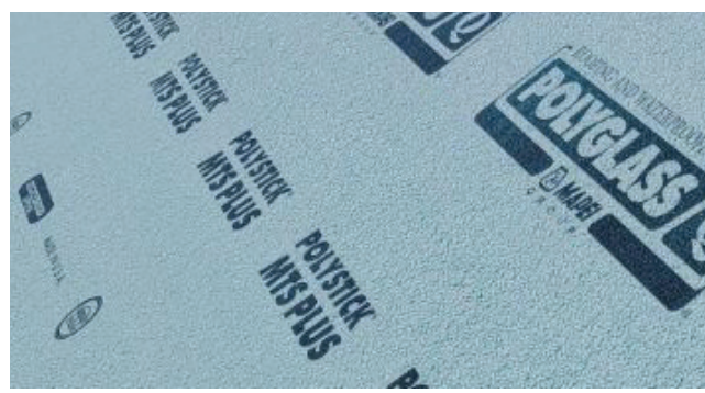
Modified bitumen self-adhered underlayment - Polyglass.