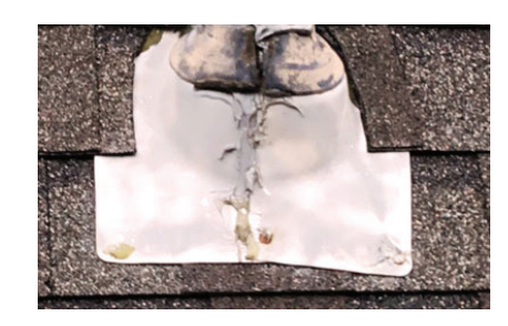
Damaged or aged roof jacks may allow water leaks in your roof.

If your roof is showing any of these signs, it may be time to start planning for a new roof. This Buyer's Guide will walk you through various aspects of the re-roofing process... from things to consider when selecting a new roof to material comparisons and options to questions you should ask your roofing professional. It is our goal to assist you in your re-roofing journey and to help make your experience as seamless as possible.