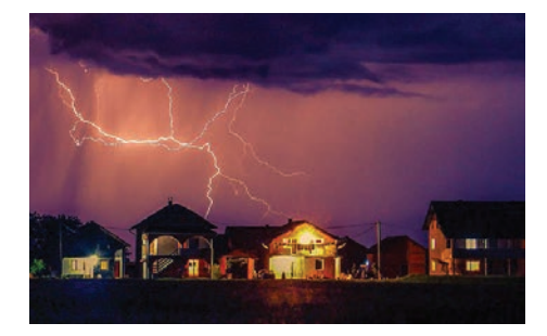
Research has shown that metal roofing does not in any way increase the risk of lightning striking the roof surface.