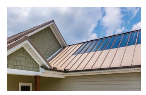
Thanks to their longevity, strength and exceptional durability, there's no doubt that metal roofs are an excellent choice when it comes to residential rooftop solar systems.

Metal is one of the most environmentally friendly roofing products on the market. Metal roofing is made of recycled material and is 100% recyclable at the end of its life. That means less in landfills and more reuse than with most other roofing products.