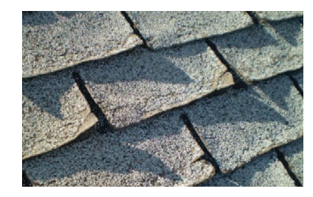
Asphalt roofing will become dry, brittle and misshapen when aged.