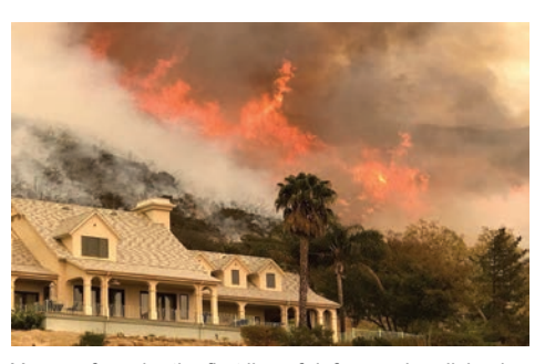
Your roof can be the first line of defense when living in fire prone regions.