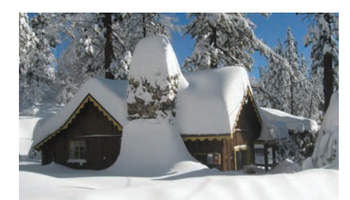
Heavy snow and ice damming can weigh down your roof potentially causing water leaks or worse.