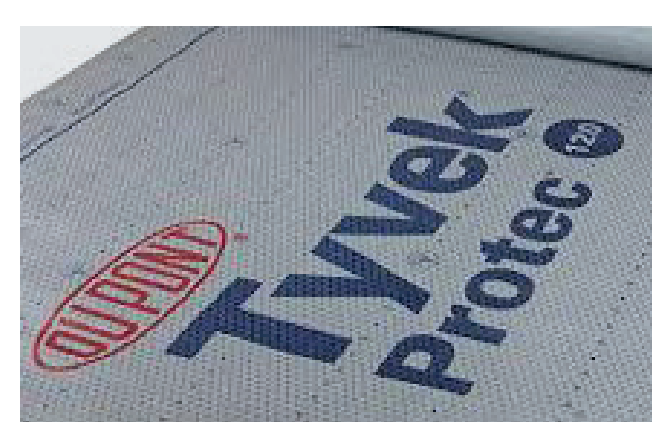
Underlayment is a critical step in the roofing process - DuPont.

A handful of underlayments fit this need, mostly in the form of a fire barrier or slip sheets. Although effective at increasing fire resistance of the roof assembly, they do not act effectively as a secondary water barrier. Recent innovations have led to the development of a modified bitumen self-adhered underlayment which is a waterproofing membrane and a fire barrier in a single product.