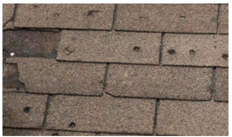
Large and fast-moving hail may compromise your roof structure's integrity.